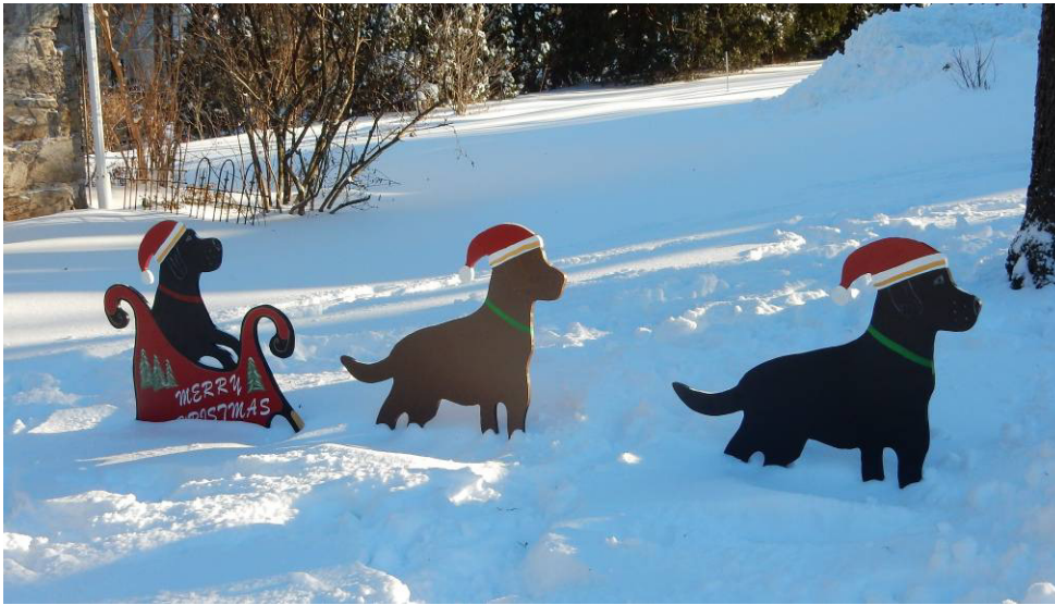
Dashing Through the Snow